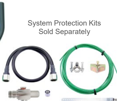
System Protection Kits Sold Separately