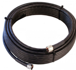
Antenna Coax Sold Separately