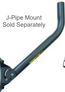
J-Pipe Mount Sold Separately